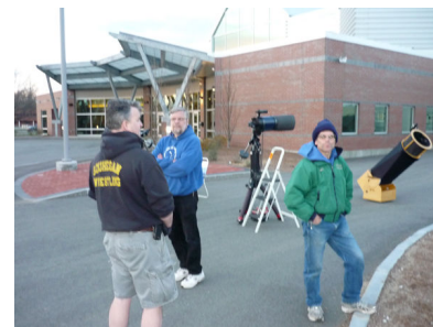
Ready for Friday evening's observing session at Aerospacefest