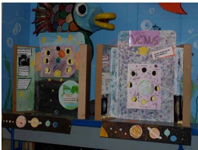
Two of the Student Posters

The students then sang a song about Pluto for the audience, lamenting its demise from the pantheon of planets but insisting it would always have a warm place in their hearts.