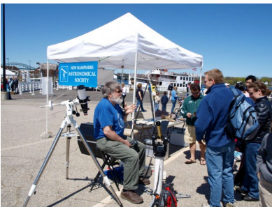
Marc offers both white light and H- \alpha