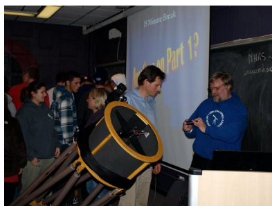
Explaining collimation of the 14" TScope.