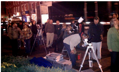
The Market Street Observatory.