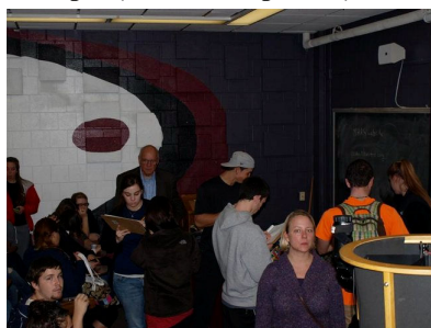
Students check out the telescopes (and cookies and cider) during the lecture break.